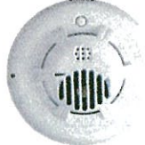
CARBON MONOXIDE DETECTOR