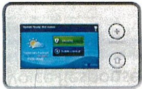
SECONDARY TOUCHSCREEN KEYPAD