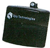
WIRELESS GARAGE DOOR RECEIVER