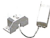
HOME DISASTER SENSOR