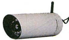
OUTDOOR "ENTRY WAY" CAMERA