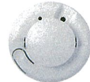
SMOKE & HEAT DETECTOR