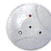
GLASS BREAK DETECTOR